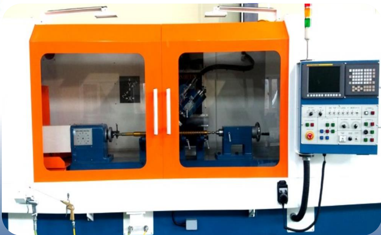
CNC SHARPENING MACHINE