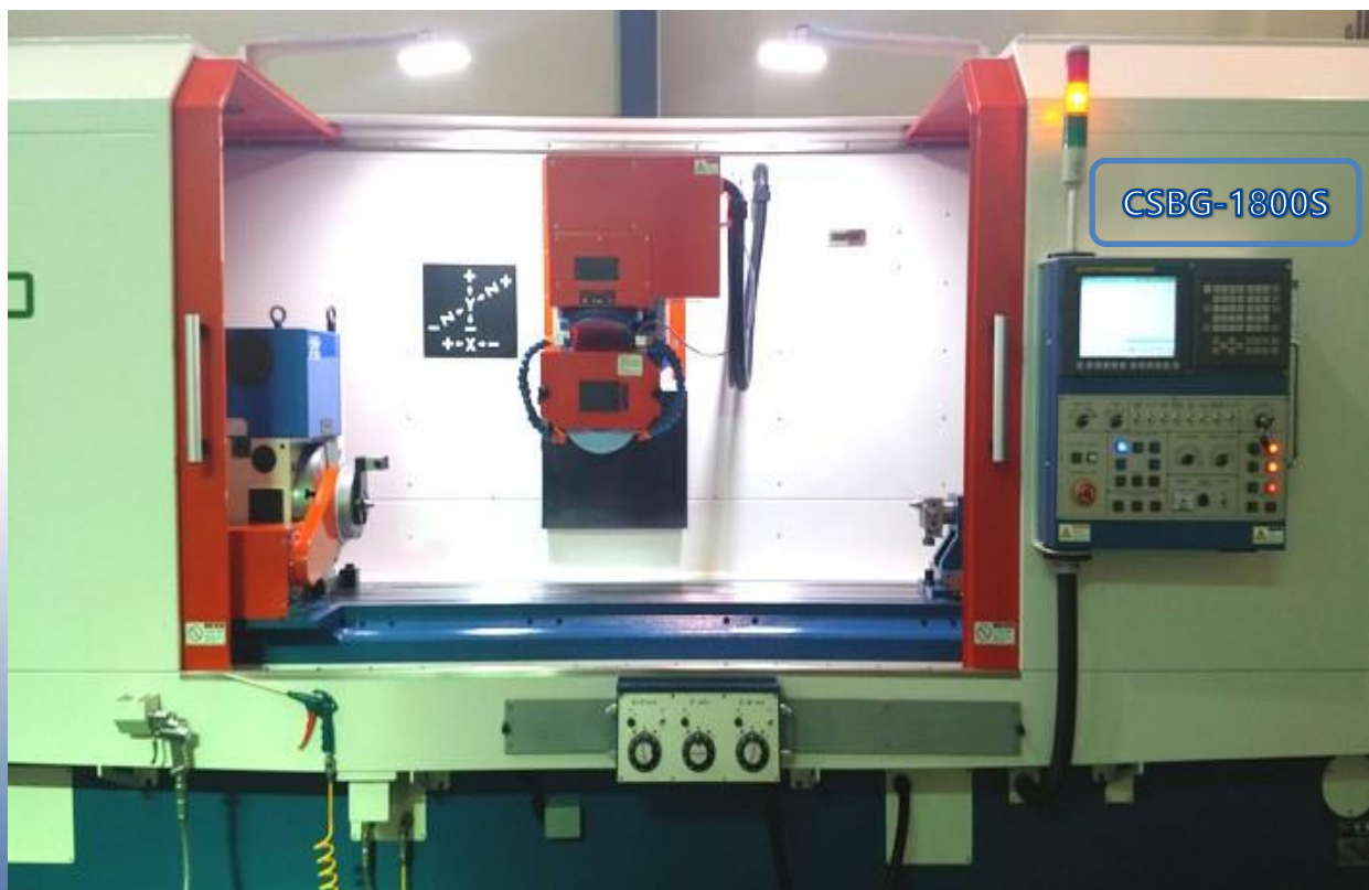
CNC BROACH SPLINE GRINDER